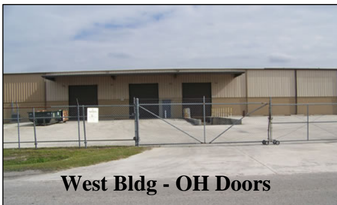
West Bldg - OH Doors